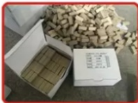
White Segment Box