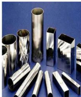
Stainless steel pipe