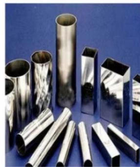
Stainless steel pipe